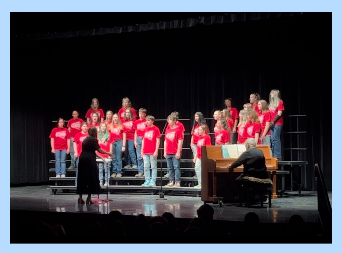
JH Choir at their Combined Concert at SFTHS on March 6th.

6th Grade/JH Choir Combined Concert - April 30th @ 7pm